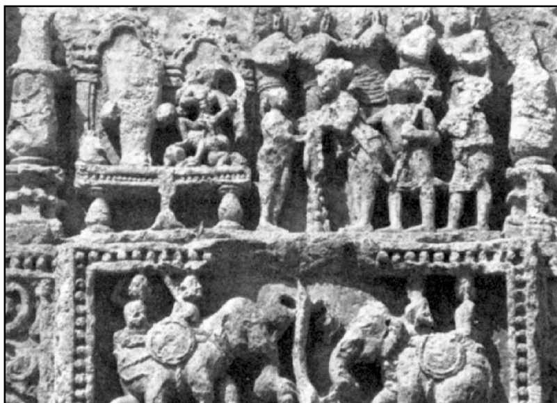
Stone Panel of Konark Temple depicting the Holy Trinity : Siva Linga, Jagannath and Mahisamardini Durga