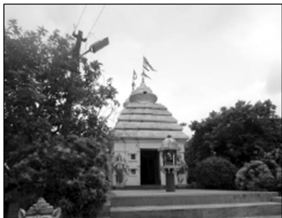
(Lord Prashanna Dev Temple)

Others say the Zamindar of Basudevpur left with much grief and sorrow to his palace. But in the night God Jagannath appeared before him