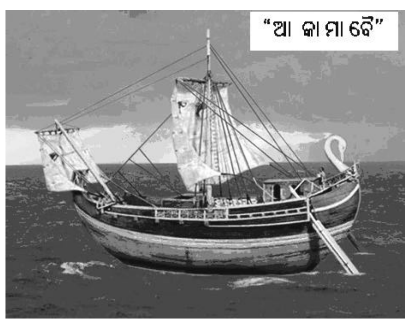
Ancient country made ship(Boita)