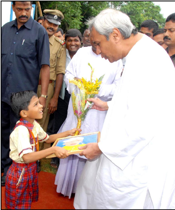
A child presenting a photograph of Dr. S. Radhakrishnan to Hon'ble Chief Minister Shri Naveen Patnaik on the occasion of Guru Divas Celebration at Bhubaneswar on 5.9.2009.