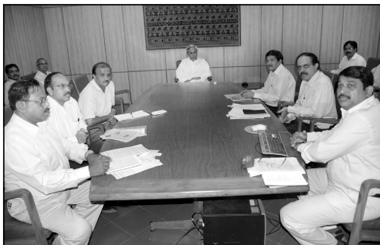
Hon'ble Chief Minister Shri Naveen Patnaik at the meeting on Environment Pollution of Puri Sea Beach at Secretariat on 24.8.2010.