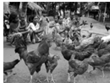
Banaraja chicks reared by his wife and daughter-in-law

well as the profitability as compared to the conventional farming system. By adopting this farming system module, Majish Gomango earned 7 times higher net monetary return (NMR) as compared to