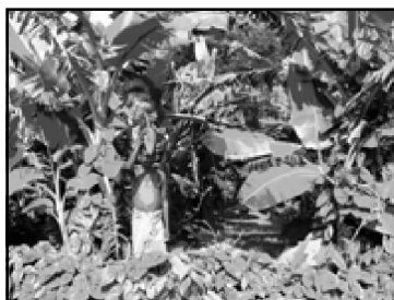
Tissue culture banana and Yam intercropping

Realizing the needs, OTELP has planned systematically to improve the livelihood of the tribal people. The first step initiated was constructing check dam in Devagiri Nala. They have