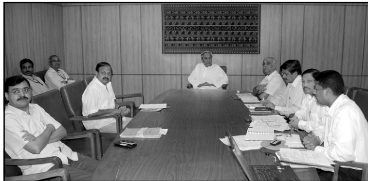
Hon'ble Chief Minister Shri Naveen Patnaik reviewing various schemes of Tourism Department at Secretariat on 25.8.2010.