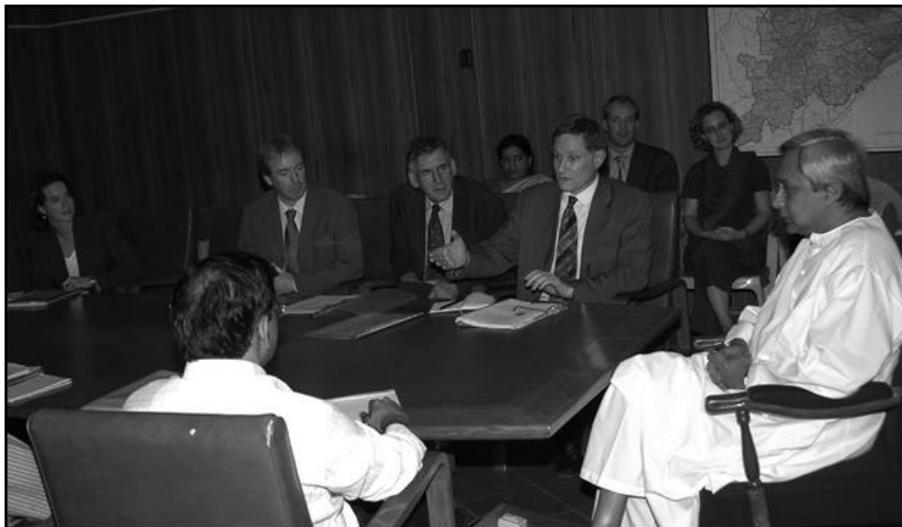
Hon'ble Chief Minister Shri Naveen Patnaik with members of U.K. Parliamentary Committee Delegation at Secretariat.