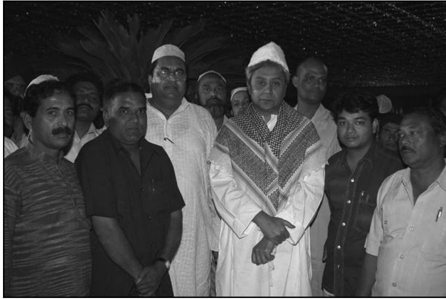
Hon'ble Chief Minister Shri Naveen Patnaik is seen in the Iftar Party at Bhubaneswar.