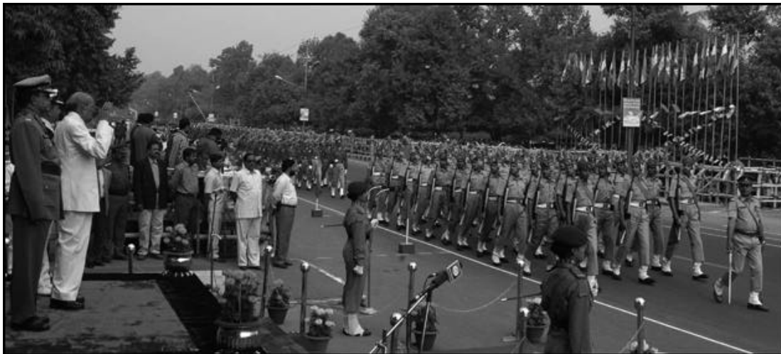
His Excellency the Governor of Orissa Shri Rameshwar Thakur unfurling the National Flag and taking salute of State Level Republic Day Parade at Bhubaneswar on 26.01.2005.