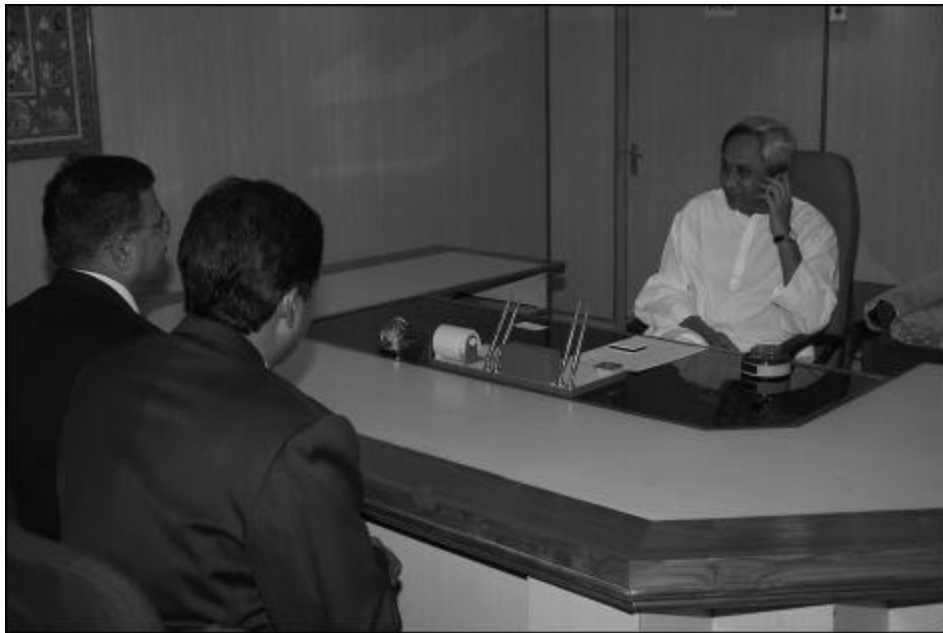
Hon'ble Chief Minister Shri Naveen Patnaik by receiving the first call launching the Airtel Telecom Service in Orissa.