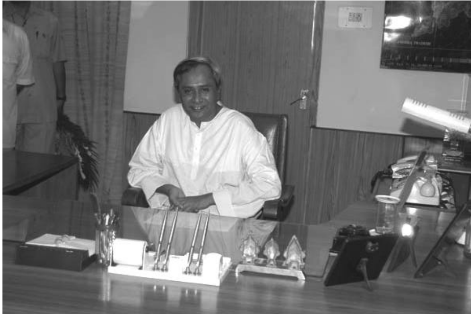
First Day in office - Chief Minister Shri Naveen Patnaik in his office chamber after assuming the office of the Chief Minister for the second term.