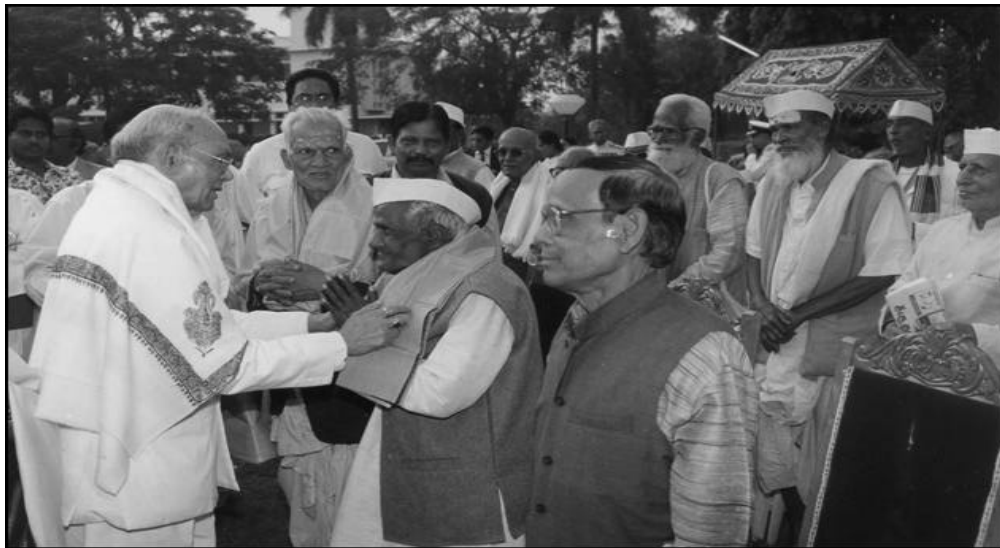
His Excellency the Governor of Orissa Shri Rameshwar Thakur felicitating Freedom Fighters in At-Home Function hosted by the Governor at Raj Bhawan.