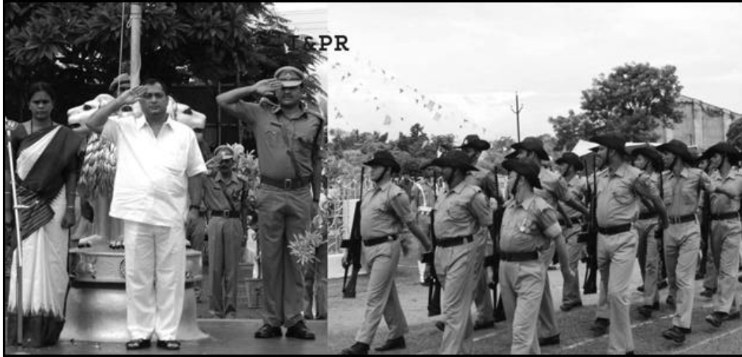
Shri Debasis Nayak, Minister of Information & Public Relations, Sports & Youth Services receiving salute at the Independence Day parade after hoisting the National Flag at Baripada.