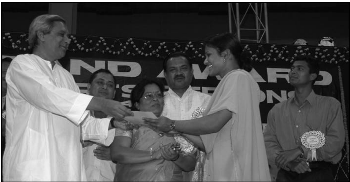
Hon'ble Chief Minister Shri Naveen Patnaik presenting awards and incentives to the sports persons of the State at Indoor Stadium, Cuttack in a function organised by the Sports & Youth Services Department. Shri Debasis Nayak, Minister, Information & Public Relations, Sports & Youth Services and Cuttack Mayor Nibedita Pradhan are also present.