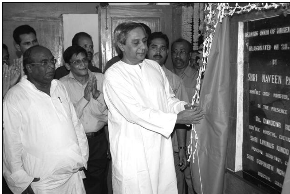
Hon'ble Chief Minister Shri Naveen Patnaik inaugurating the Museum Library at Orissa State Museum, Bhubaneswar. Dr. Damodar Rout, Minister, Panchayati Raj and Culture is also present.