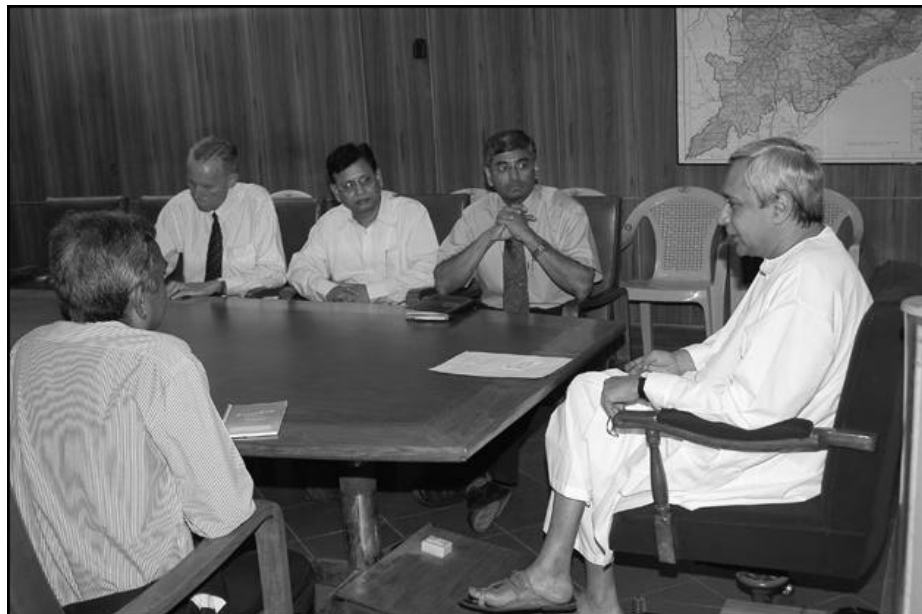
Hon'ble Chief Minister Shri Naveen Patnaik discussing the development of irrigation potentiality of the State with the World Bank team at State Secretariat.