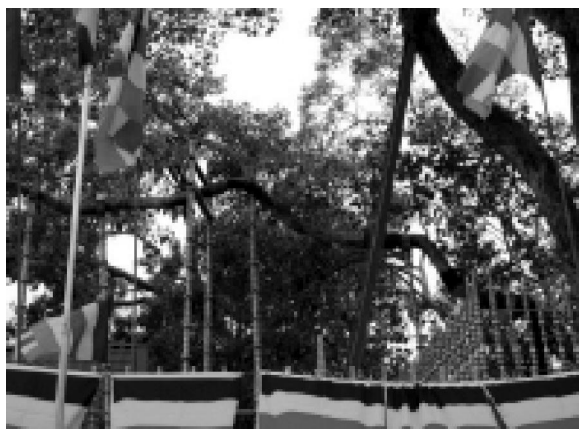
The original Branch of Bodhi Tree (3rd c. B.C) Anuradhapura

valleys from the river Rupnarayan on the lower Ganga Valley to the river Vamsadhara down south which were all parts of Kalinga country presents an unique sacred geography that enriched maritime heritage of our state. All these Buddhist sites are located on the coastal area in one row and developed some in 3 rd century BCE and some in 4 th -5 th century CE and continued up to 12-13 th century CE. It is an established fact that like Magadha, Kalinga was an important geographical orbit where cities like Tosali, Kalinganagar, Somapa, Dantapura, Simhapura were in existence at the earliest period of Indian history. Here, it is appropriate to quote R Balkrishnan that remarkable similarities between place names of Java, Sumatra and Bali regions of Indonesia on the one hand and the place names of Odisha, particularly those of southern Odisha, on the other as revealed by his study. He says that the Chilika region, the districts of Ganjam and Gajapati along with adjoining boarder areas of Andhra Pradesh (Srikakulam Dist particular) seem to have been focal points of Kalingan interaction with South East Asia (Balakrishnan 2007:155:OIMSEAS)