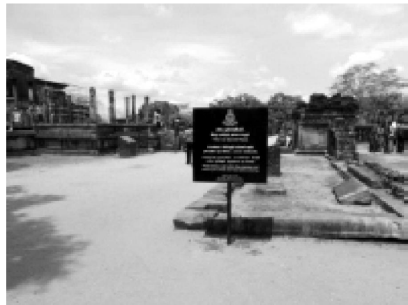
The Buddhist Temple built by Nissankamalla at Polonnaruwa -ancient Capital of Sri Lanka.

In the earliest strata of historical period (3 rd century BCE) of Indian History, the Mauryan attitude to the sea and maritime trade is known from various sources. Meghasthenes considered that Mauryan had a state monopoly on ship building. Arthasastra recommends that the state supervision of shipping was under the officer navadhyaksa . One has to take into account the fact that the Mauryan realm included within it long stretches of coastal edicts are sites like Sopara in Konkan, Girnar in Kathiawad, and Tamralipti, Palur, Dantapura, Kalingaptnam, Tosali, Dhauli and Jaugada (Somapa) in Kalinga, which are situated on or near the coast.